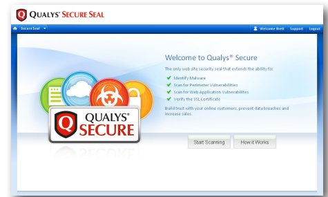
Simple & Easy-to-Use Interface

Qualys SECURE Seal subscriptions are sold annually starting at $495 per year per web site. Sign up for a free trial at: http://www.qualys.com/SEAL