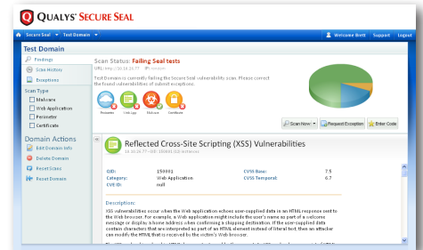
Verified Remediation Steps